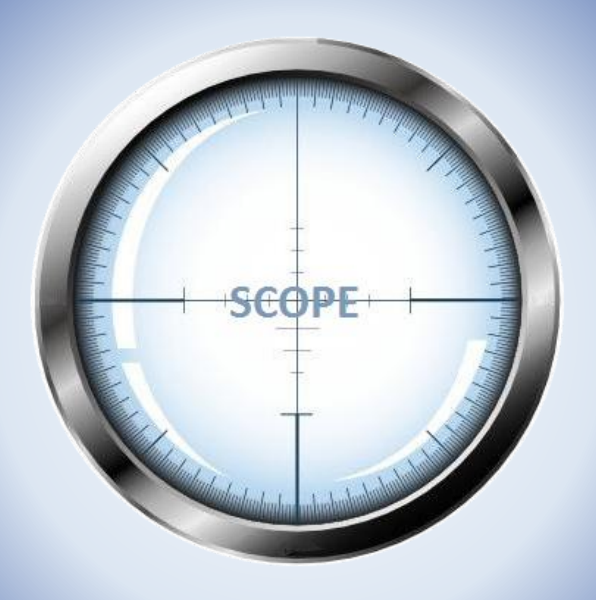
Comparing Public Policy Frameworks for Mobile Communication Devices