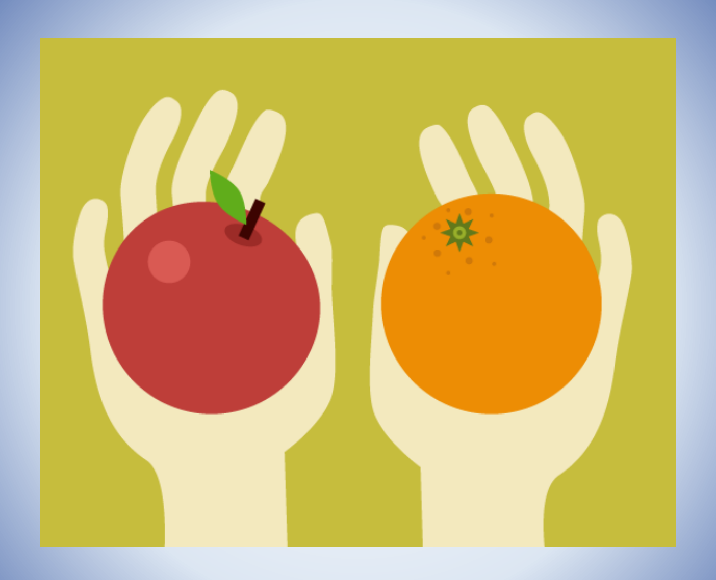
Comparing Public Policy Frameworks for Mobile Communication Devices