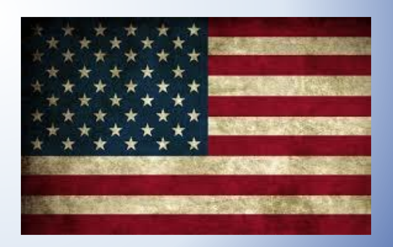
Comparing Public Policy Frameworks for Mobile Communication Devices